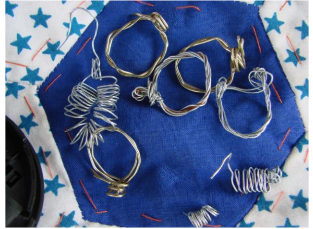
George drilling holes in shells for the hanging curtain; Melody's complete crocheted outfit; rings the girls created, shown here on one of the quilts they made themselves.